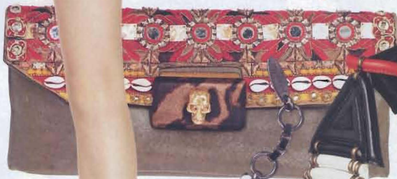
5. Alexander McQueen