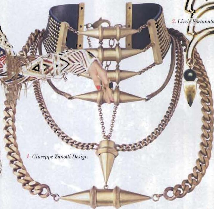
1. Giuseppe Zanotti Design