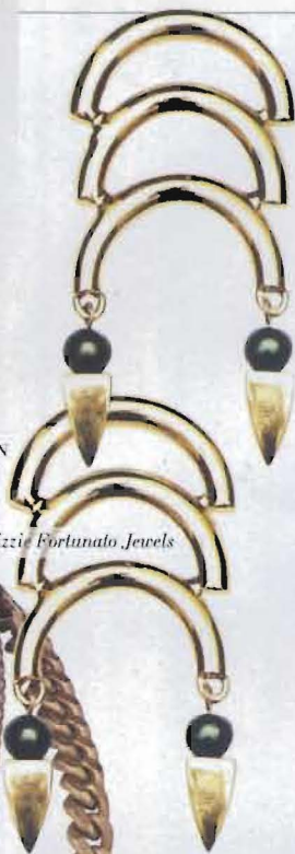
2. Lizzie Fortunato Jewels