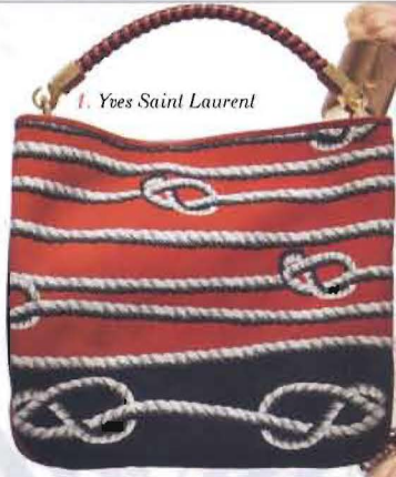
1. Yves Saint Laurent