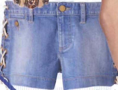
4. Tory Burch