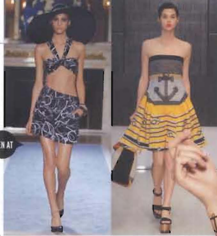
SALVATORE FERRAGAMO | YVES SAINT LAURENT