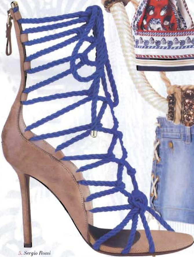
5. Sergio Rossi