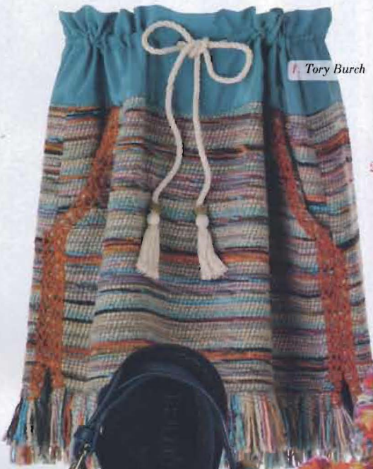
1. Tory Burch