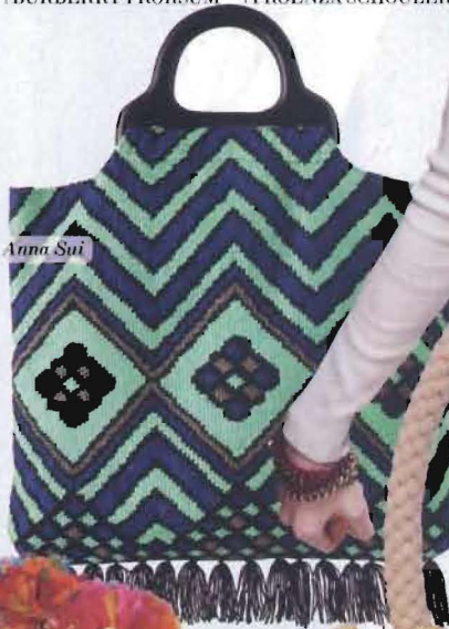
2. Anna Sui