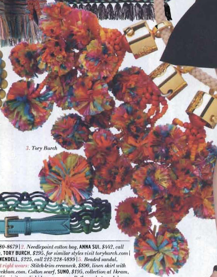
3. Tory Burch