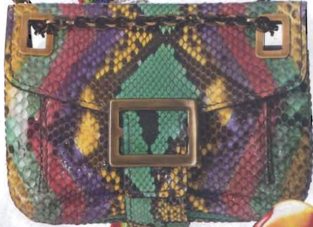
2. Roger Vivier