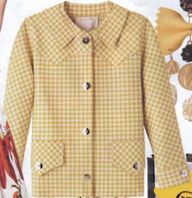
1. Marc Jacobs