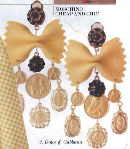
2. Dolce & Gabbana