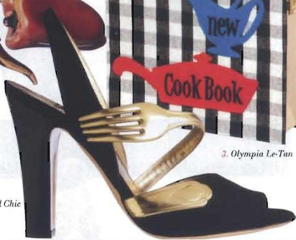
3. Olympia Le-Tan

1. Gingham leather jacket, MARC JACOBS, price on request, call 212-343-1490 | 2. Farfalle charm earrings, DOLCE & GABBANA, $445, visit dolcegabbana.com | 3. Embroidered canvas clutch, OLYMPIA LE-TAN, $1,542, visit olympialetan.com | 4. Grosgrain and leather pump, MOSCHINO CHEAP AND CHIC, $495, call 212-243-8600 | 5. Pepper and tomato charm bracelet, DOLCE & GABBANA, $645, call 877-70-DG-USA | Model at left wears: Cotton chili pepper print top, $995, skirt, $1,095, macaroni charm bracelet, $595, pepper and tomato charm bracelet, $645, all, DOLCE & GABBANA, at select Dolce & Gabbana boutiques nationwide. Gingham leather head wrap, $350, Maryjanes, $695, all, MARC JACOBS, at Marc Jacobs, NYC