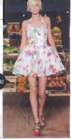
MOSCHINO CHEAP AND CHIC