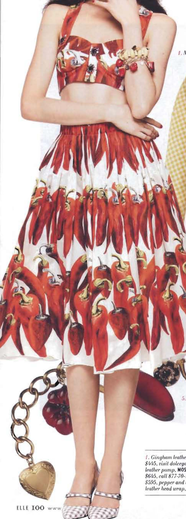
5. Dolce & Gabbana