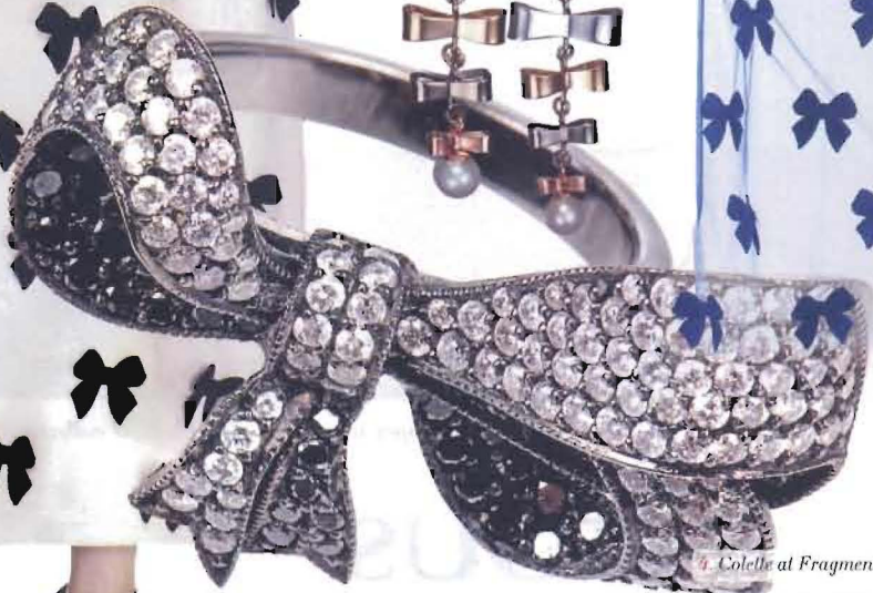
4. Colette at Fragments