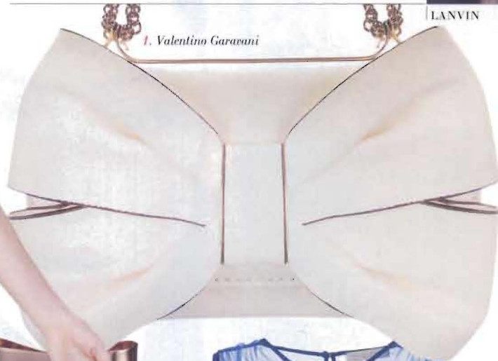
1. Valentino Garavani